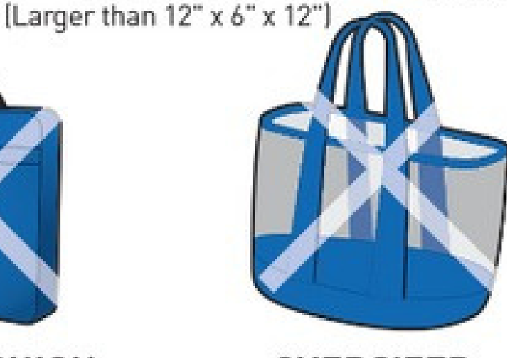
OVERSIZED TOTE BAG