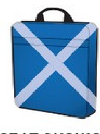
SEAT CUSHION WITH POCKET